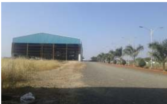
Internal Road from Forging Shop