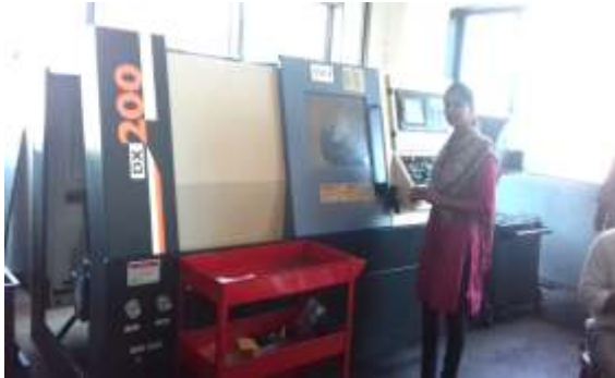
CNC Machine shop